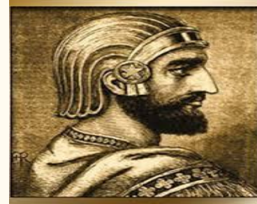
Cyrus The Great