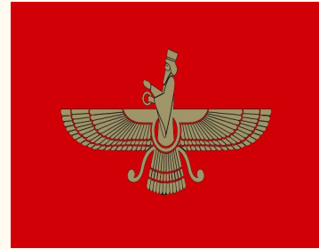
The Persian Symbol