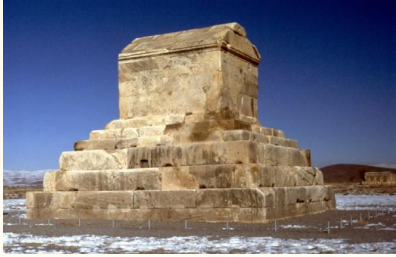
A Persian Temple