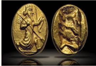
A Persian Coin